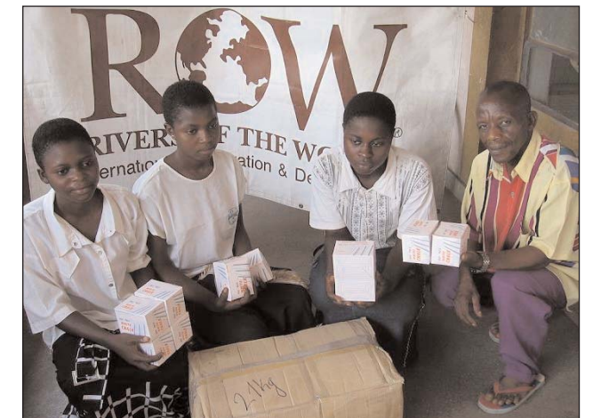
While large numbers are impressive, it’s the individual victories that stay in our heart.

■ An elderly homeless woman came to our eyeglass clinic in Bolivia. When fit with a pair of prescription glasses, she reached into a paper bag and pulled out a piece of cloth and a sewing needle. She began to sew and cry at the same time. Losing her eyesight meant that she lost her home and her job as a seamstress. Her new glasses enabled her to get her job, her home, and her self esteem back!